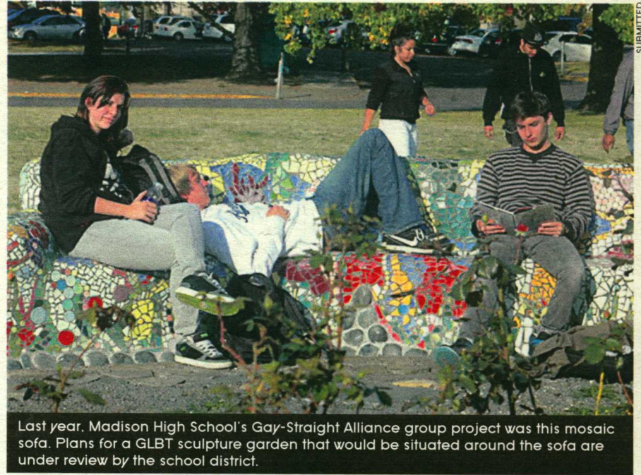
Last year, Madison High School's Gay-Straight Alliance group project was this mosaic sofa. Plans for a GLBT sculpture garden that would be situated around the sofa are under review by the school district.

The garden will be located in Madison's turn-around area, where the mosaic sofa is located. A couch decorated with flowers